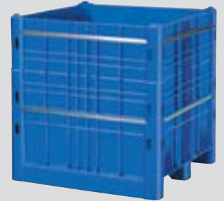
Special height SH - 1140