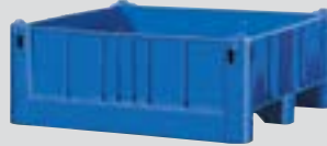
Special height SH - 440